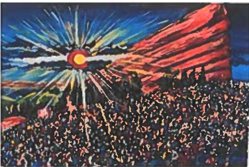
Scramble's painting of Easter Sunrise Service at Red Rocks, April 17, 2022.

His bold use of color, powerful compositions and highly energetic technique add to the concert experience as he creates a unique work during every show. Scramble has created over 550 original works of art, painted live at Red Rocks. His complete portfolio includes almost 3,000 pieces from nearly 1,000 musical events cross the country.