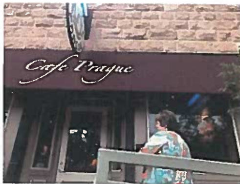
Figure 6. Stone Buildings