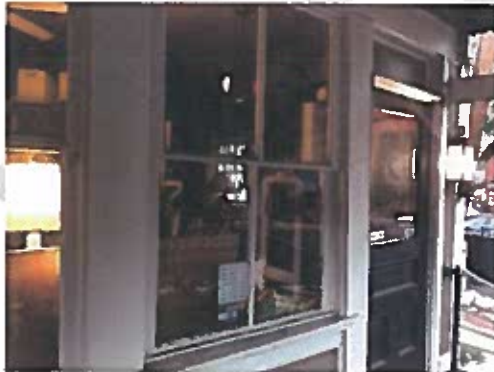
Figure 11. Historic Windows

[INSERT WINDOW IMAGES – TOWN HALL AND MORRISON COMMUNITY CHURCH]