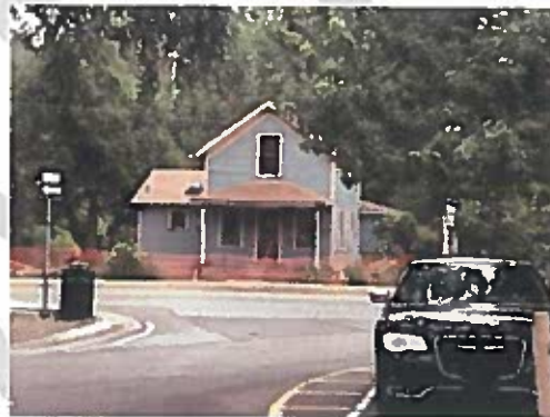
Figures 2 & 3. Colorado Territorial