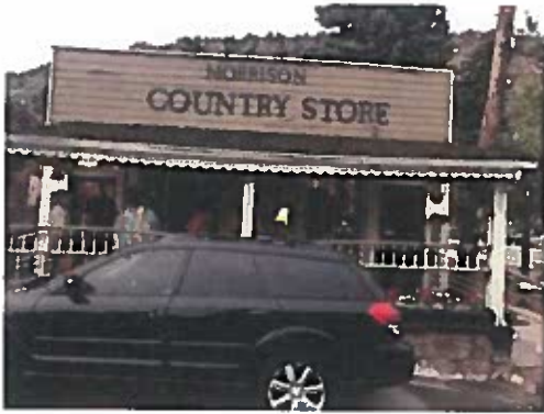
Figure 5. Colorado Territorial with Gingerbread Porch