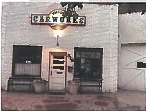
Figure 13. Example of Creative Sign in Morrison

Signage can alter the perception of a place and create lasting impressions. Old Town Morrison contains a variety of signage types that add to the eclectic feel.