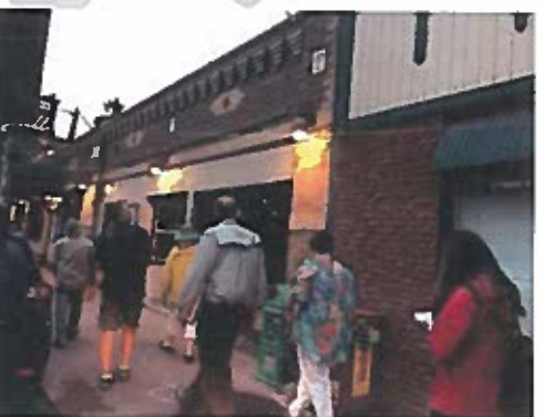
Figures 9 & 10. Historic Brick