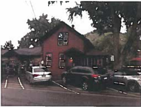
Figure 1. Victorian Style

particular era or design type as it is important to encourage a variety of high-quality architectural types that blend old and new. This integration has made our Town what it is today.