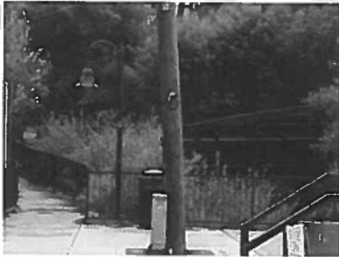
Figure 14. Pedestrian Lighting in Morrison

[ADD SPECIFICATIONS FOR LIGHTING TYPE DESIRED BY TOWN]