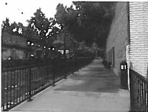
Figure 12. Existing Public Space

contribute to community pride and identity and can contribute to improved property values on the site and in surrounding areas.